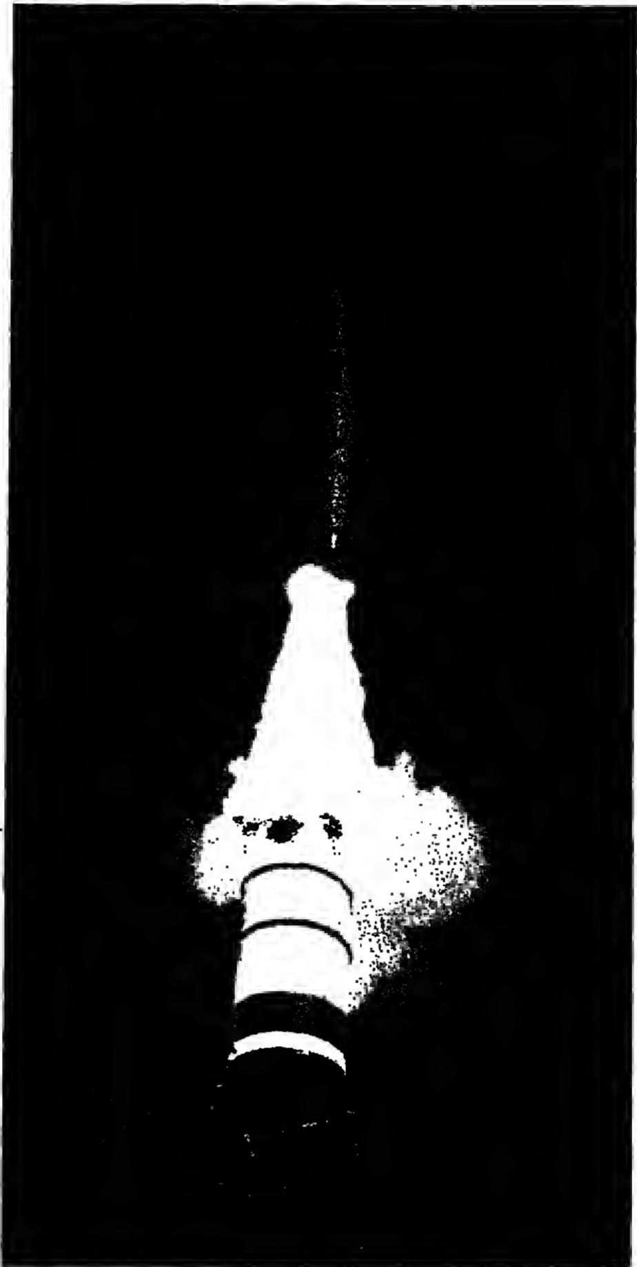
Fire away: International law has not addressed missile warfare.

The court added, "However, in view of the current state of international law, and of the elements of fact at its disposal, the court cannot conclude definitively whether the threat or use of nuclear weapons would be lawful or unlawful in an extreme circumstance of self-defense,